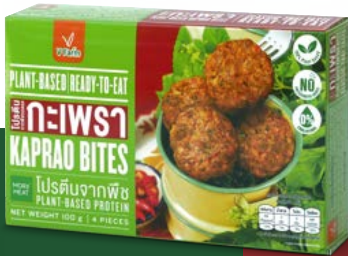
PLANT-BASED KAPRAO BITES

V Farm Plant-based Larb Bites are 100% plant-based. Crafted with plant-based meat from More Meat that is carefully folded into bite-sized shape and seasoned with exotic Thai herbs and spices into creating the perfect spice and herby Larb taste.