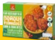
PLANT-BASED CORN & CRAB BITES