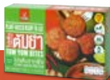
PLANT-BASED TOMYUM BITES