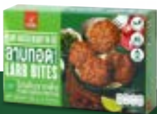
PLANT-BASED LARB BITES

V Farm Kaprao Bite are 100% plant-based. Crafted with plant-based meat from More Meat that is carefully molded into bite-sized shape and seasoned with exotic Thai holy basil, chillies and spices into creating the perfect spicy and herby Kaprao taste.